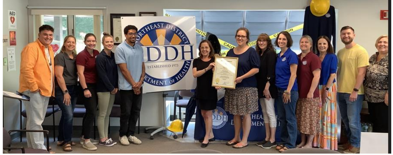
(NDDH staff and CT State Senator Mae Flexer with an official citation from the CT General Assembly in recognition of the agency's 50 years of preventing illness, promoting wellness, and protecting public health.)

NDDH Celebrates 50 Years of Providing Public Health Services to Northeast CT