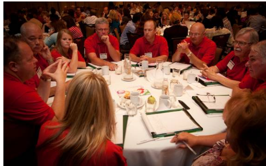
Team members from Longview, Washington, discussed their ACHIEVE coalition’s planned activities.

“in the loop” (through e-mails, newsletters, one-on-one and group telephone calls, listservs, and Web sites); monitor the overall progress of the coalition; ensure the presence of clear processes; track and resolve conflicts; and ensure the development of clear action plans and evaluation strategies. Often, coaches or other coalition support staff members, for a variety of well-meaning reasons, invest a disproportionate amount of time to the program work of the coalition. This type of engagement can drastically reduce the time that support staff can spend as process champions and block member investment. This, in turn, can reduce member buy-in, impair coalition function, and negatively affect coalition outcomes.