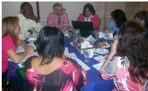
Coalition representatives from North Miami, Florida, formulated plans for action in their community at the ACHIEVE Action Institute in Alexandria, Va., in July.

First, local coalition leaders (also referred to as coaches, facilitators, or coalition organizers) may not realize that a particular practice is important. In other words, coalition leaders “don’t know what they don’t know.”