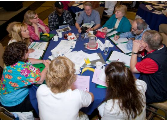
Team members from New Bedford, Mass., were hard at work at the Alexandria ACHIEVE Action Institute.

Okay, so mobilizing others to agree on and implement policy and system change strategies can take more time. But more time than what? Having individuals develop and implement policies on their own? In most cases, community