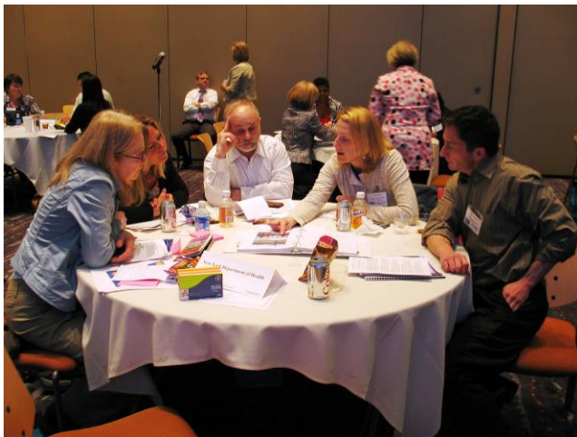
Community leaders from New York State discussed future projects and plans during one of the At-Work Time sessions.

CDC's Healthy Communities Program hosted the first-ever Action Institute for Strategic Alliance for Health (SAH) communities April 14–17 at CDC's Headquarters in the Senator Tom Harkin Global Communications Center in Atlanta. The Action Institute was designed to help train SAH representatives in creating healthier communities through sustainable, innovative,